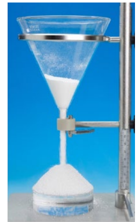
Improved flowability of Ibuprofen DC 85 W