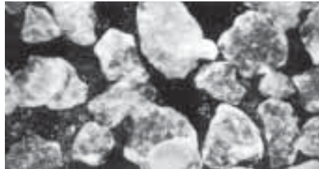
Loose dust surrounds caustic soda flakes.

In water treatment for softening pH control and regenerating resin beds.